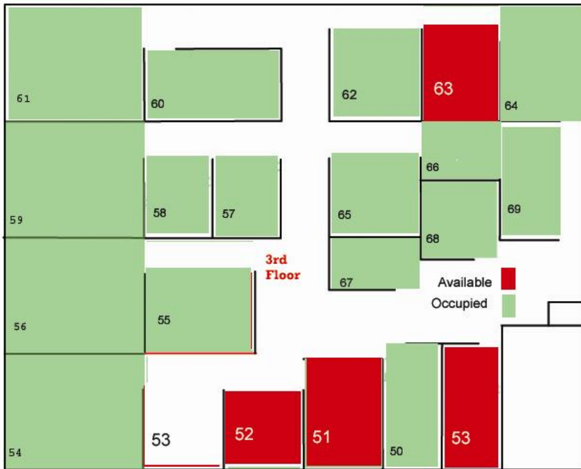
SE1 new studios 3 rd floor availability ■