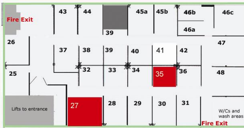
Existing 4 th floor availability ■